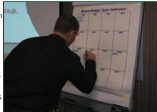
Members record their Myers-Briggs results on a chart for everyone to see