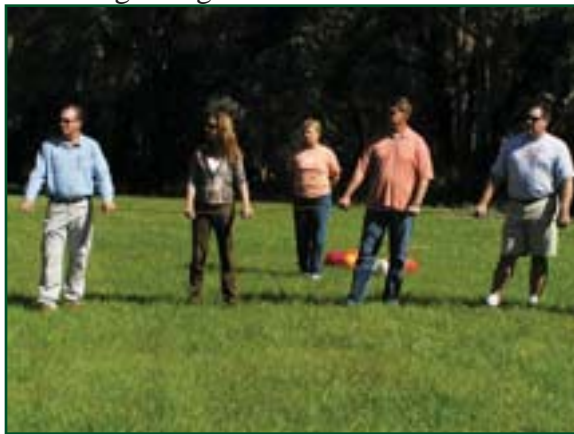
Class VII members build trust while participating in the low and high ropes course

The remainder of the day was spent working through problem solving and critical thinking exercises focused on team building. I myself spent plenty of time critically thinking how a “low ropes course” published in the agenda for that day turned out