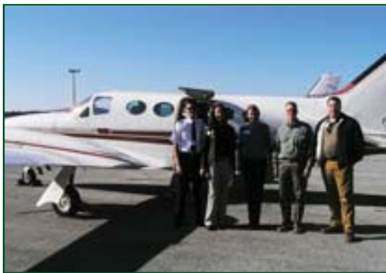
Group 2 prepares for their flyover of Gainesville

As we drove around the area more and more, we saw how development had moved in and was pushing more and more into this once very rural area of Greater Gainesville. Yet, we remember from the sky all we could see are trees. We pulled into the only nursery in the area just to capture the prospective of a local agribusiness in the area. It seemed